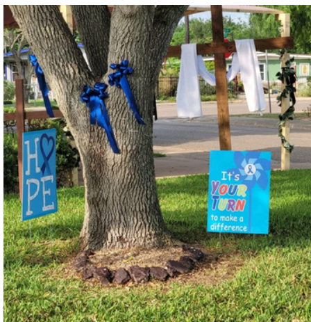
St. Theresa Catholic Church of San Benito

Whatever your hand finds to do, do it with all your might... - Ecclesiastes 9:10