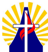
Wesley Methodist Church, Harlingen