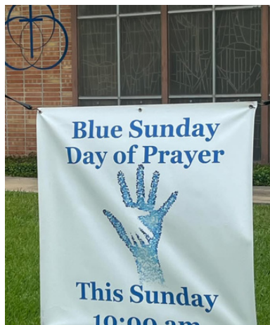
Wesley Methodist Church of Harlingen